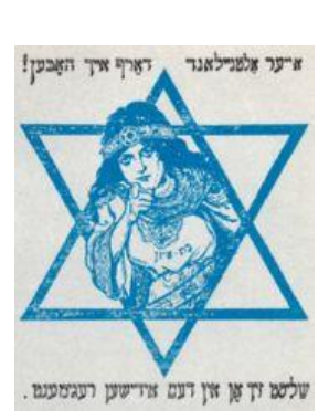
The Daughter of Zion

In texts uncovered at <u>Ugarit</u>, references to "Zephon" (Tsephon) have been identified with the Syrian mountain <u>Jebel Agra</u>. In these texts, the mountain is the holy place of the gods, where the god known as the "<u>Lord</u>" reigns over the divine assembly. The word "Zephon" is a common Semitic word for "North", and some have considered it to be possibly cognate with the Hebrew name Zion (Tsiyyon). Psalm 48:2 mentions both terms together: "...Har-Tsiyyon yarktey Tsafon..." ("Mount Zion on the Northern side"), usually taken to refer to the north side of Mount Zion, not necessarily indicating that Zion is found to the North.