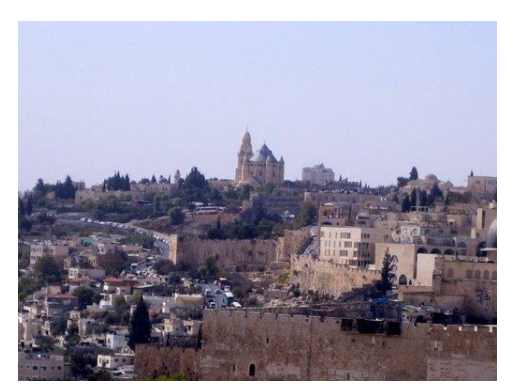
"Awake, awake; put on thy strength, O Zion" (Is 52:1) The Church of God must wake up!

By C M White Version 1.2 1980, 1987, 2008, 2009, 2018