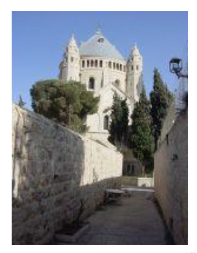
The Dormition Church, situated on the modern "Mount Zion"

Zion, or Sion (צִּיּוֹן "Height", <u>Standard Hebrew</u> Tziyyon, <u>Tiberian Hebrew</u> Tsiyyôn) is an archaic term that originally referred to a specific mountain near <u>Jerusalem</u> ( Mount Zion ), on which stood a <u>Jebusite</u> fortress of the same name that was conquered by <u>David</u>.