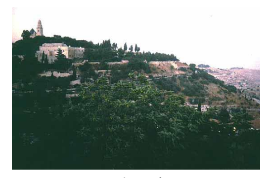
Mt Zion today