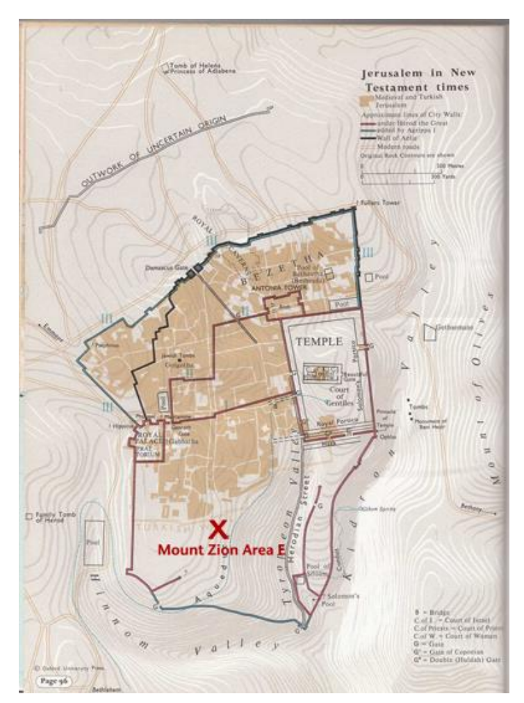
Mt Zion in relation to Jerusalem