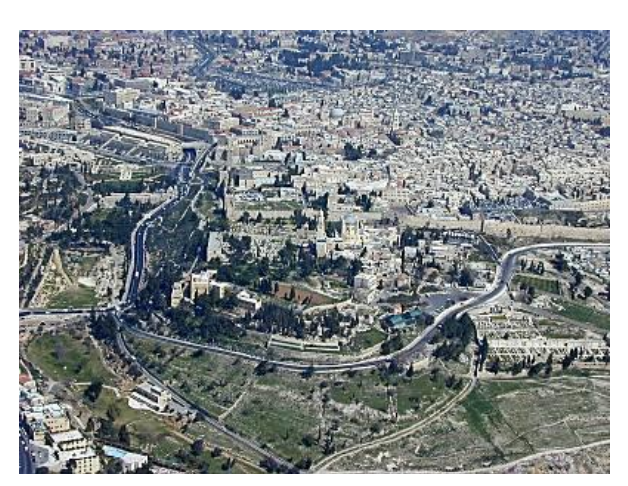
Aerial view of Mt Zion

In the above prophecy the images of the daughter of Zion, Zion and a woman are intertwined, referring to the same concept. Indeed, the context reveals that the House of Israel and the spiritual Israel, or Church of God, are jointly referred to in a dual sense.